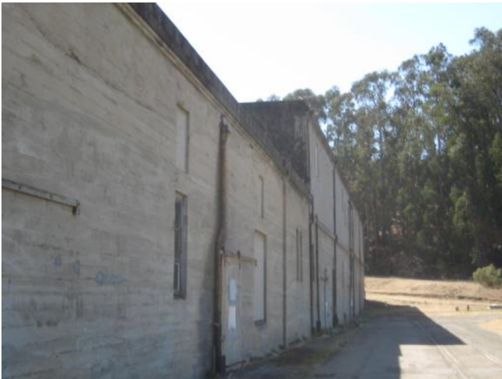
Looking south along west side of Building 6