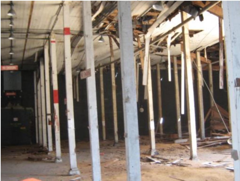
Northern one-story area of Building 6 showing partial collapse of roof structure