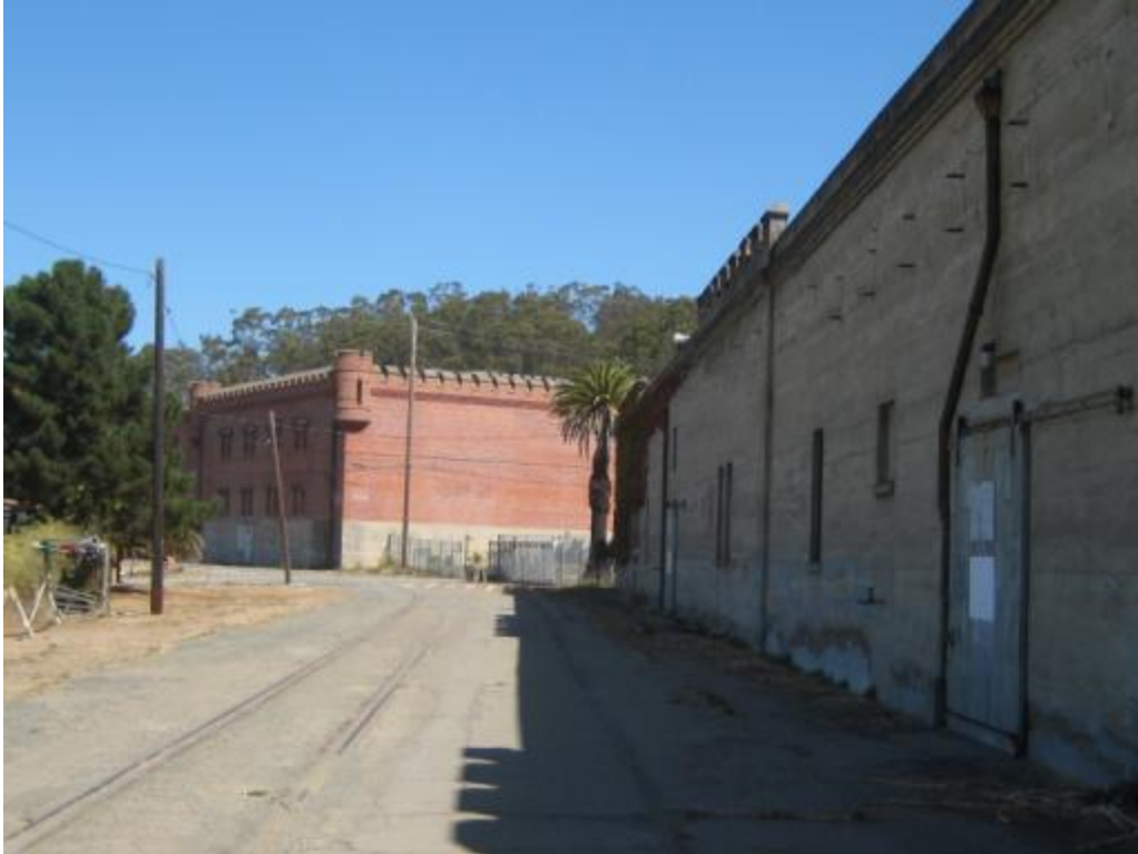
Looking south along west side of Building 6 towards Building 1