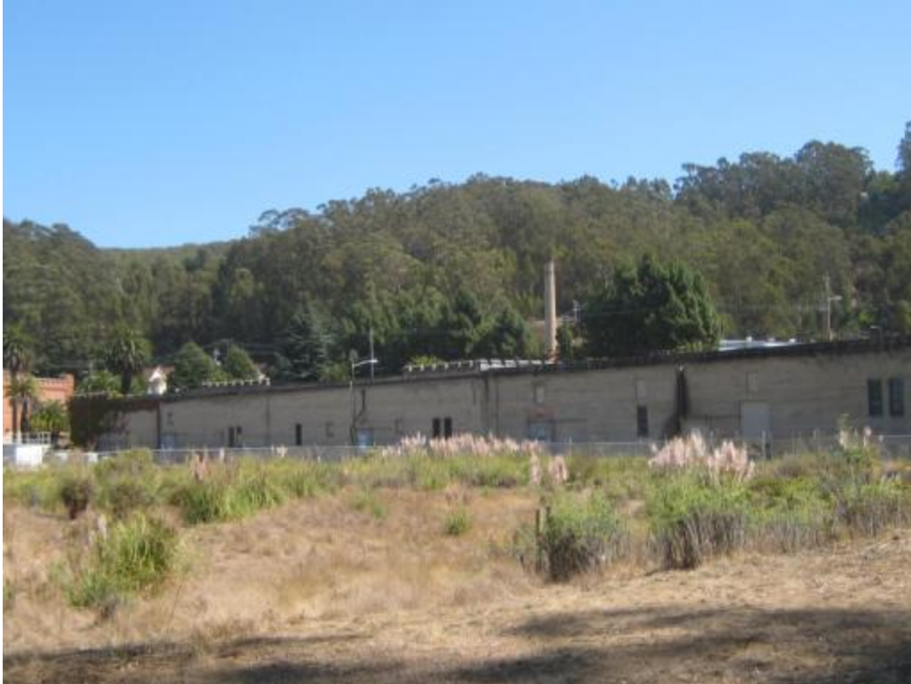
West façade of one-story portion of Building 6