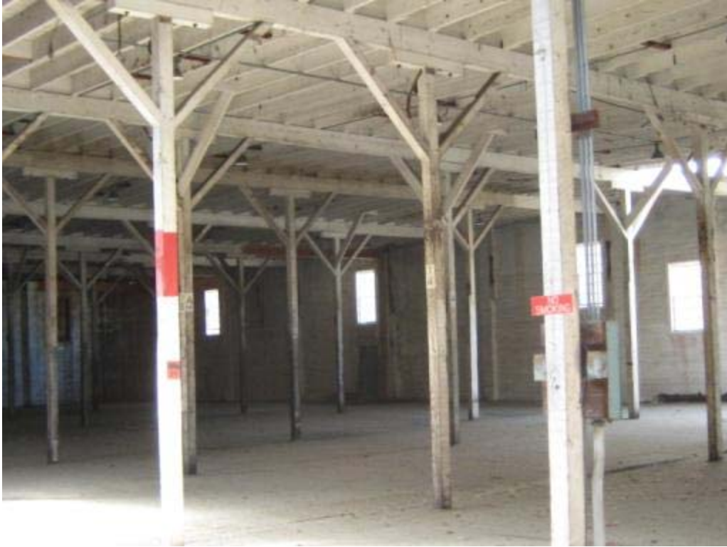
Upper level of two story portion of Building 6