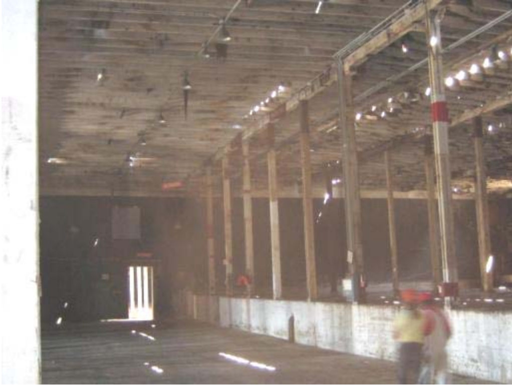
Lower portion of southern one-story area of Building 6. Note light coming through roof sheathing indicating membrane has failed.