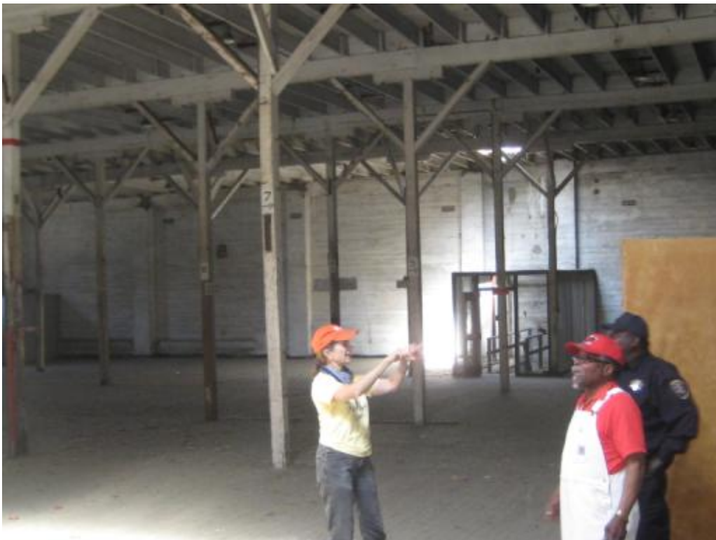
Upper level of two story portion of Building 6