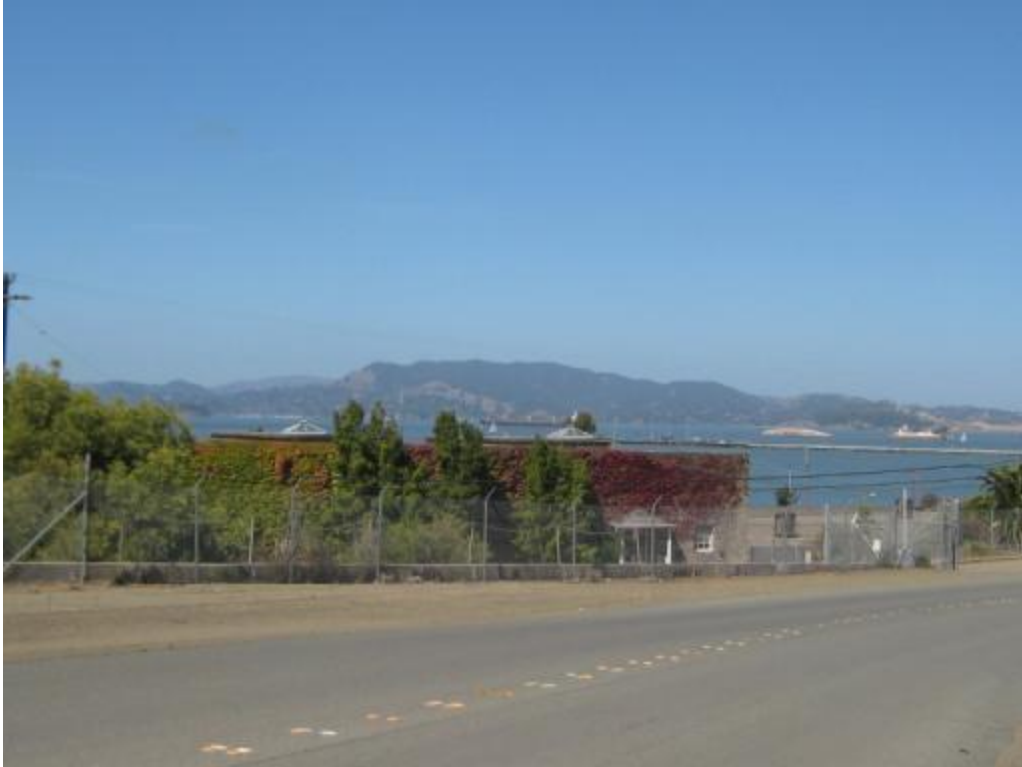
Looking over two story section of Building 6 to the west over San Francisco Bay