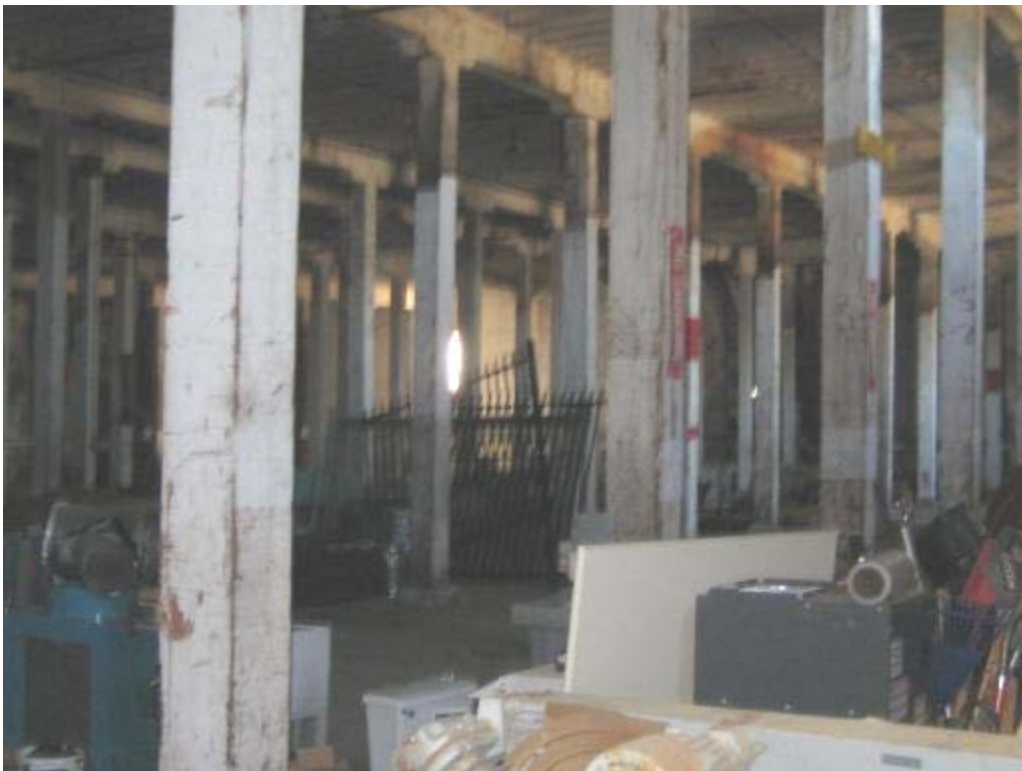
Lower portion of two-story area of Building 6