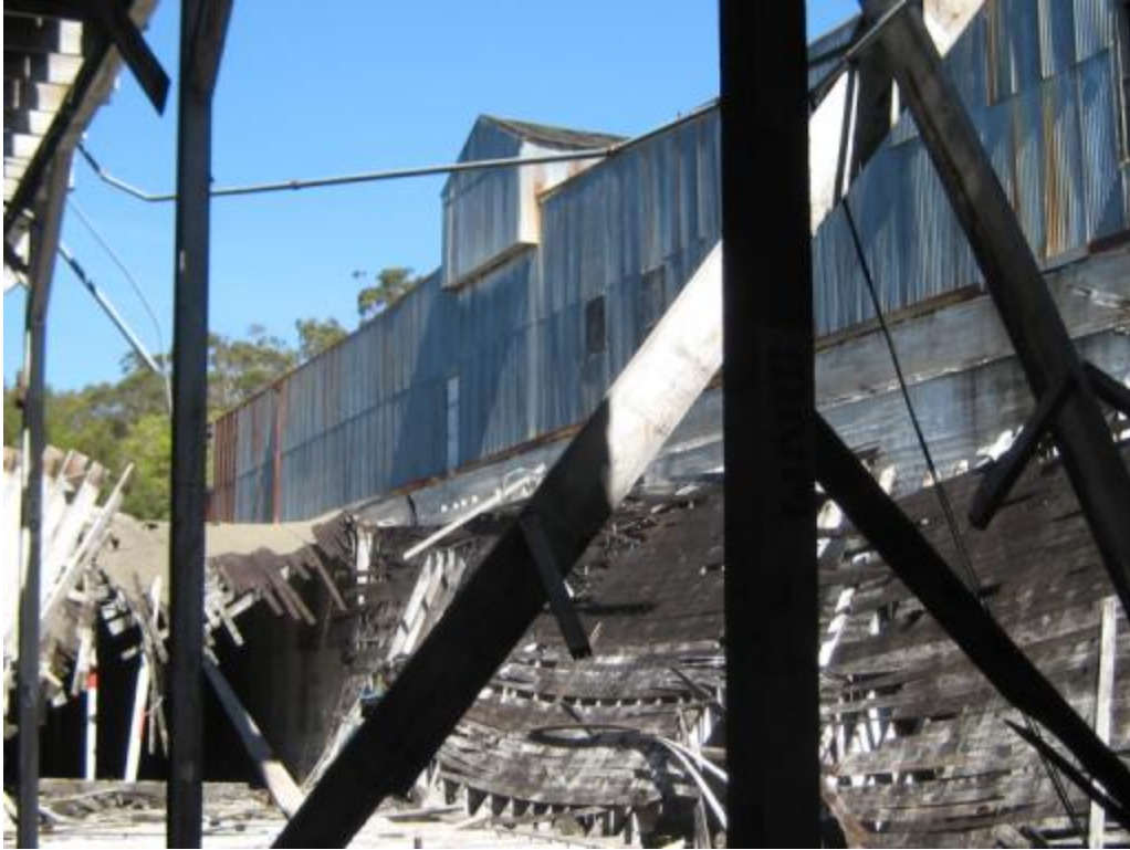
Northern one-story addition to Building 1 showing roof collapse that occurred in 2008