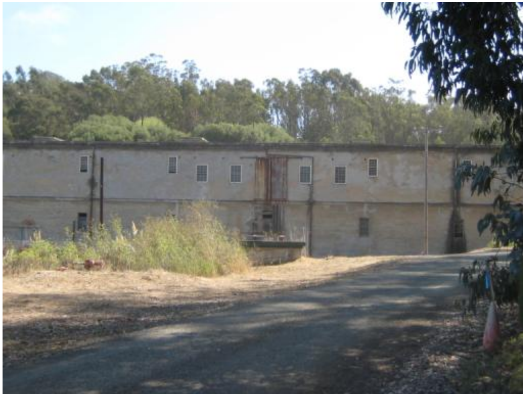
West façade of two-story portion of Building 6