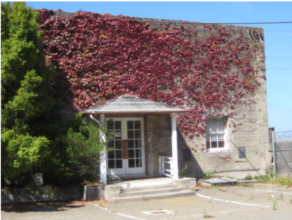
Northeast corner of two-story section of Building 6