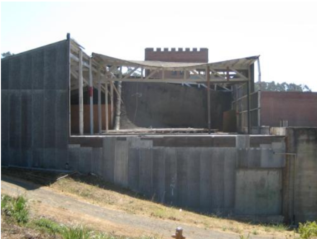
Partial collapse of wood frame building east of one-story addition to Building 1.