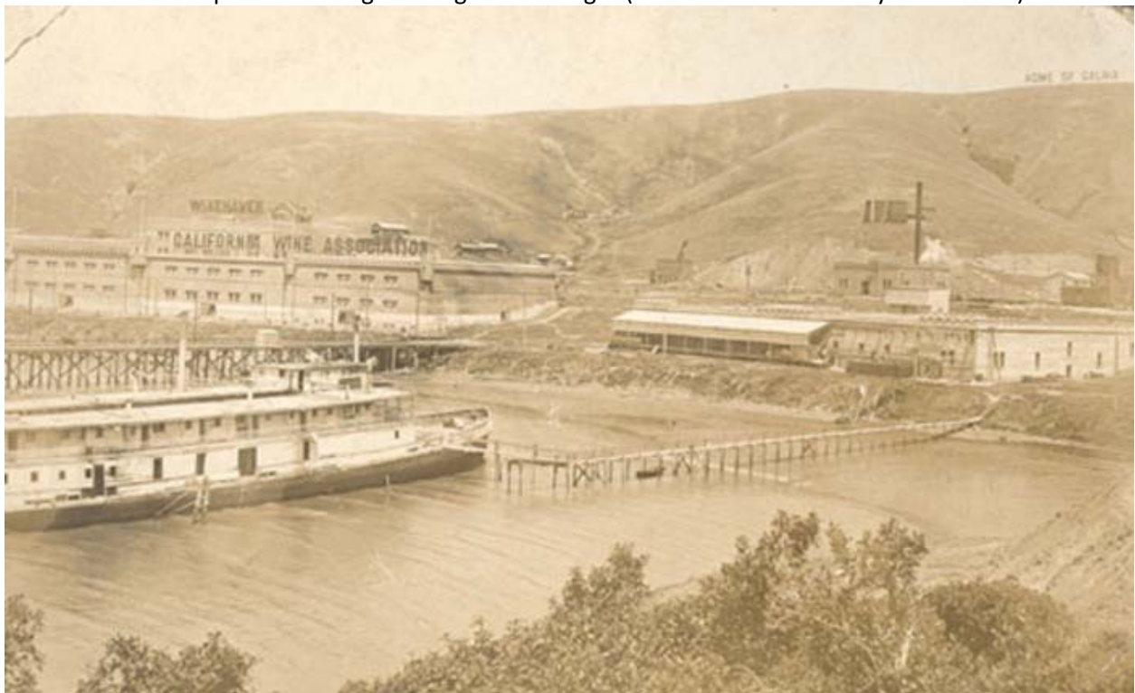
Historical photo showing Building 6 on the right