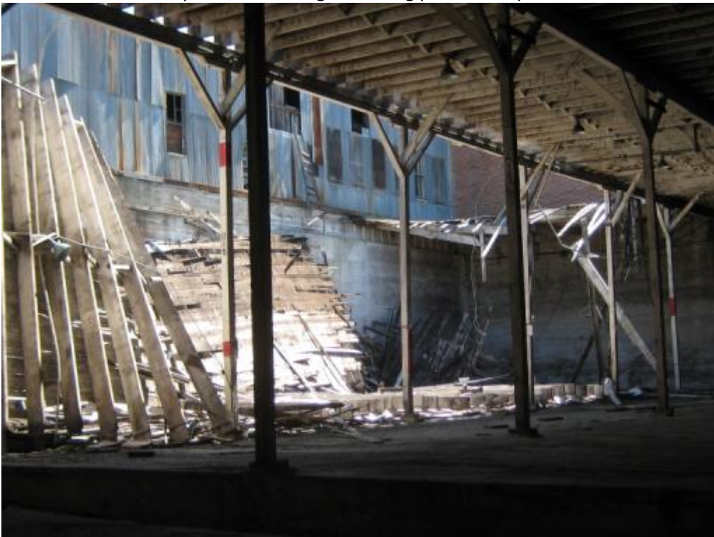
Northern one-story addition to Building 1 showing roof collapse that occurred in 2008