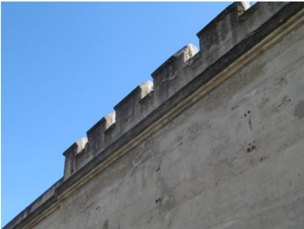
Crenellations on west parapet of one-story section of Building 6