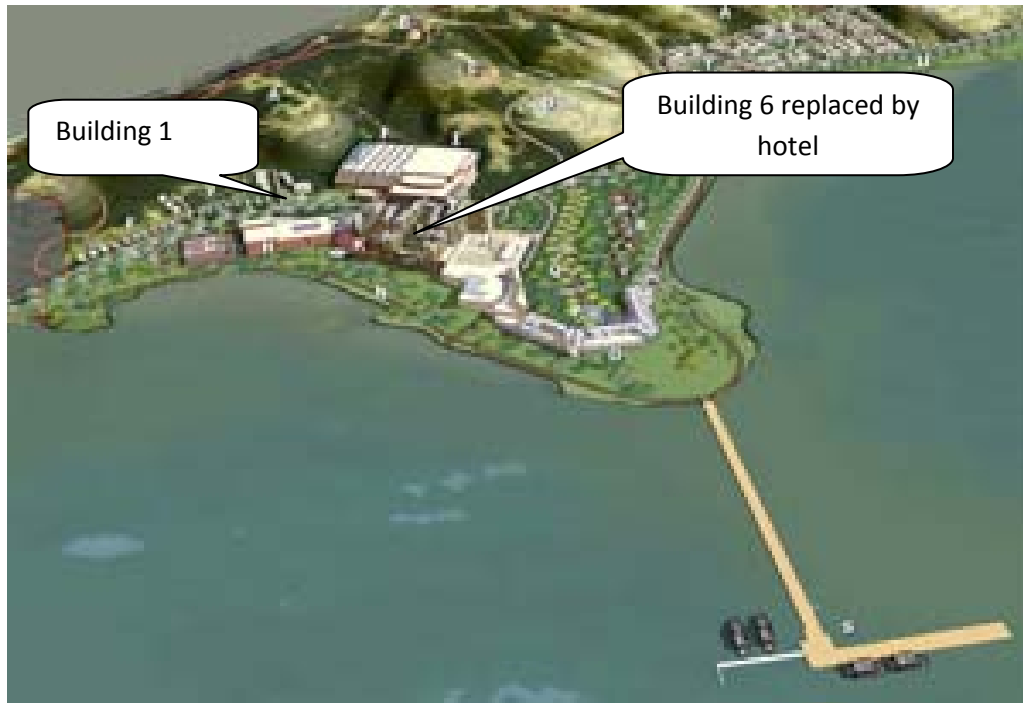
Rendering of proposed development