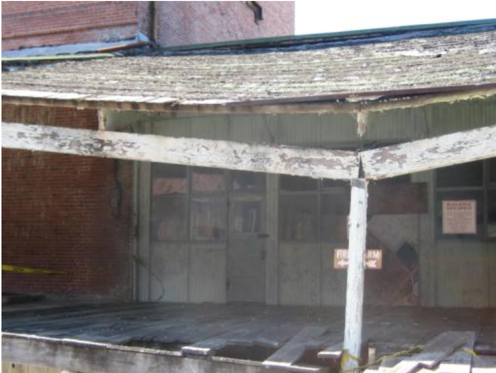
Partial collapse of canopy on the east side of Building 6