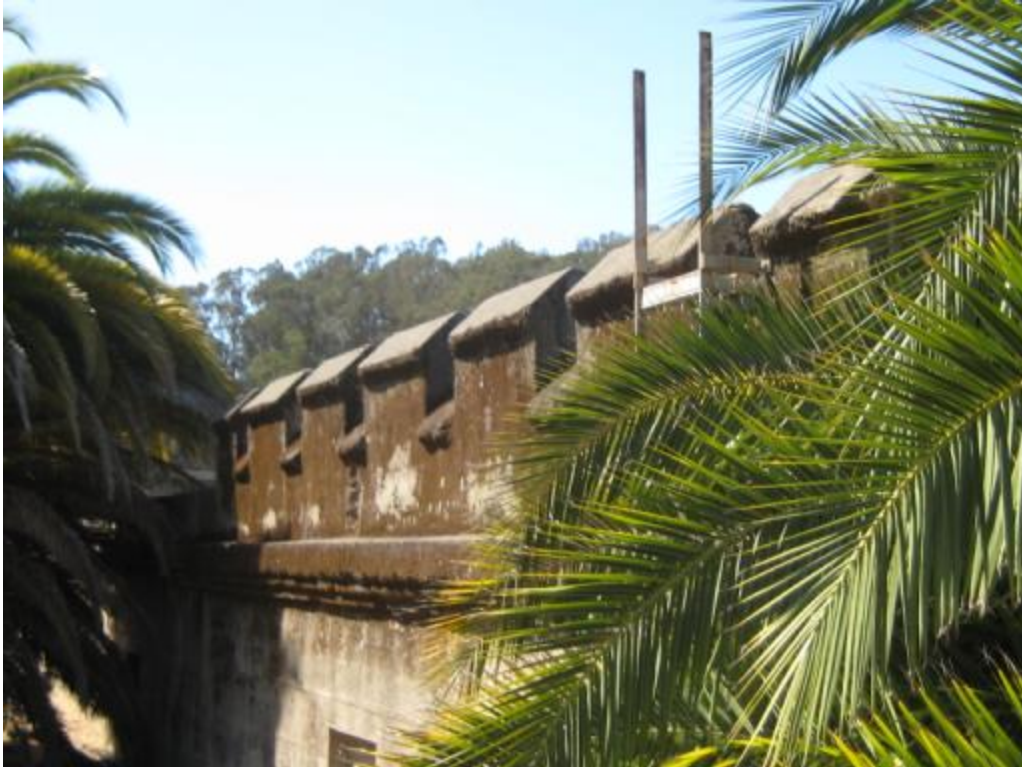
Crenellations on northeast corner of Building 6